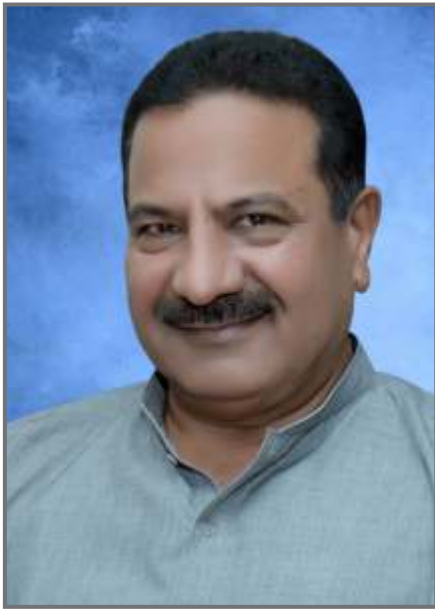
Prof. Dr. Muhammad Zafar Iqbal