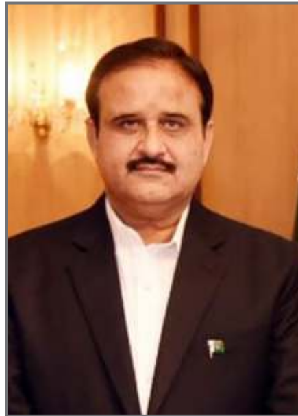
Sardar Usman Ahmad Khan Buzdar