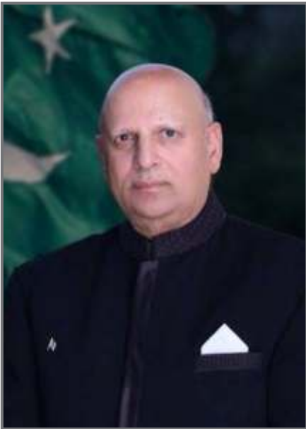
Chaudhary Muhammad Sarwar